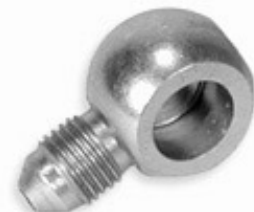
Banjo-type adaptor fitting

Hand-tools, obviously, can undo and re-attach the adaptors, in the same way that hand-tools are required to undo and re-attach a brake hose assembly directly to a brake calliper.